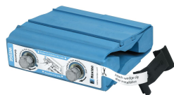
Wedge & Wedgekit